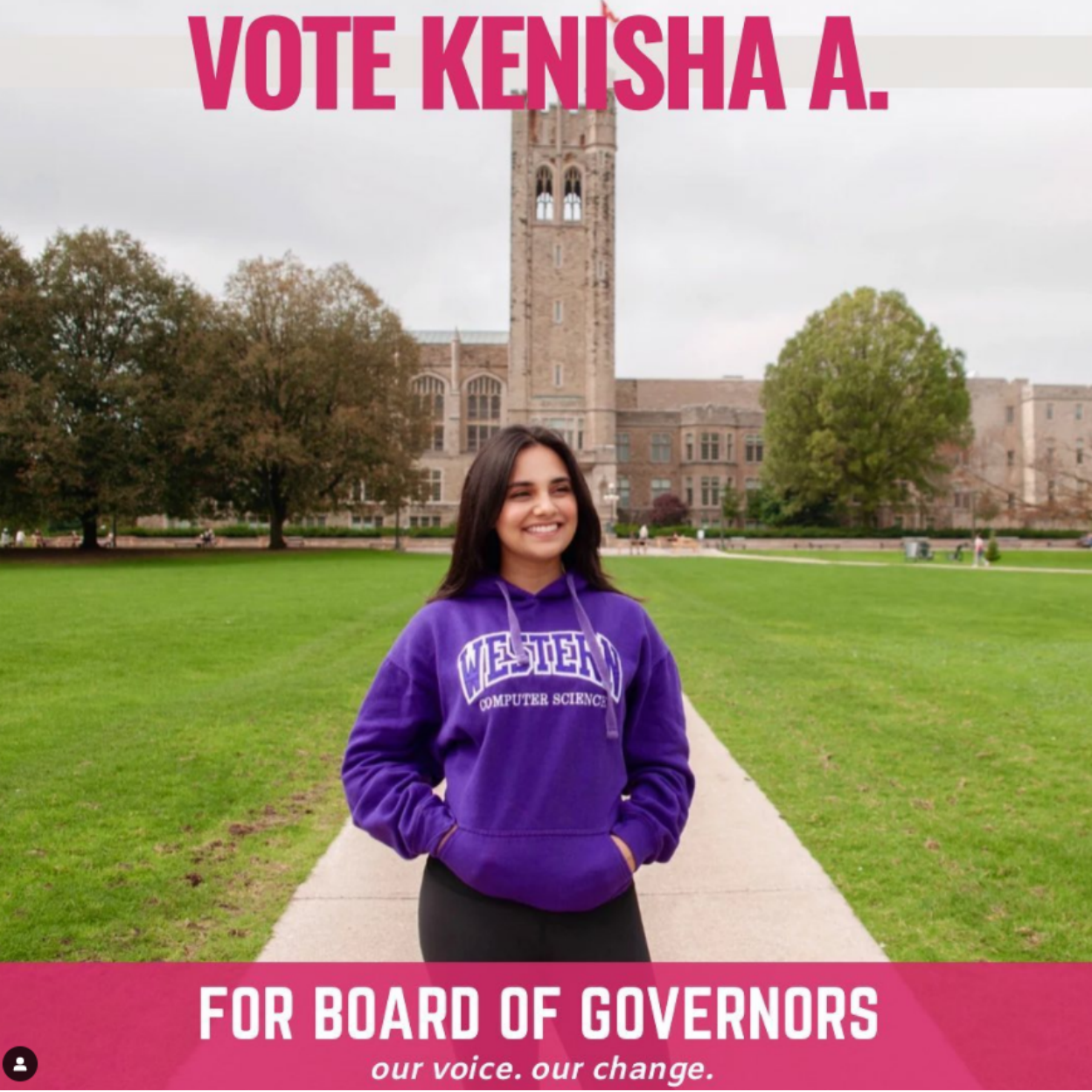
Exhibit 1: A sample of Kenisha Arora’s campaign graphics. The Western name is prominently displayed.